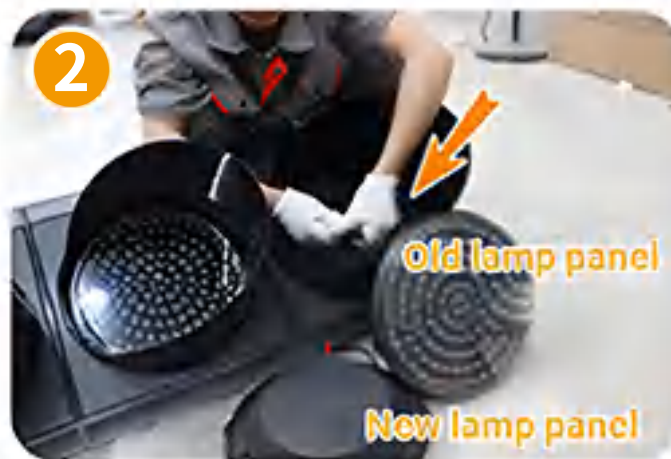
Insert new light cable