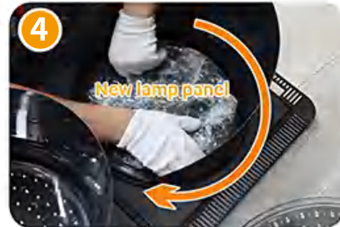
Install new light panel